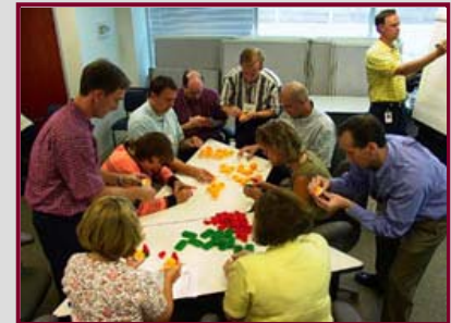
On a voyage to team effectiveness...